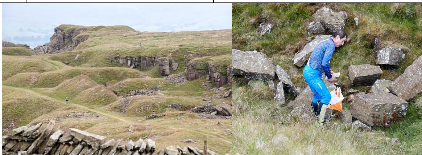
including the editor punching a control.